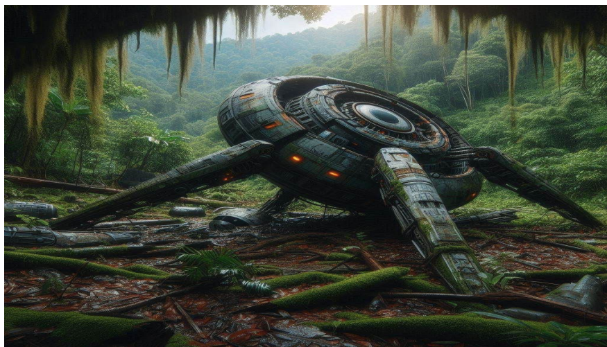
Photo of captured Martian Vessel in the Jungles of Brazil