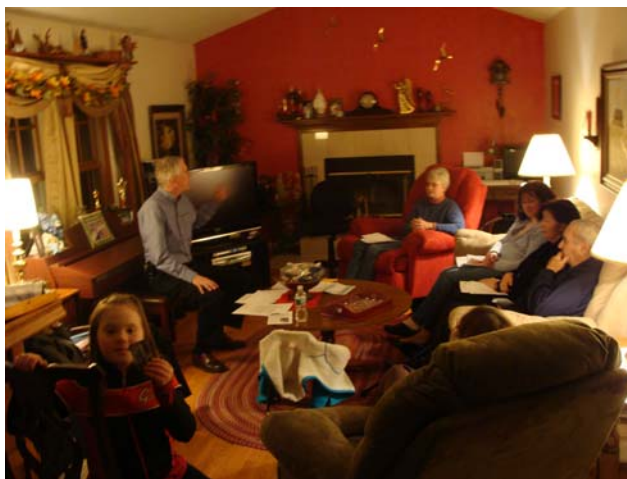
Members of St. Joseph Marian Center’s Board of Trustees at a recent meeting.

May God Bless us as we turn to Him through Our Lady of Fatima.