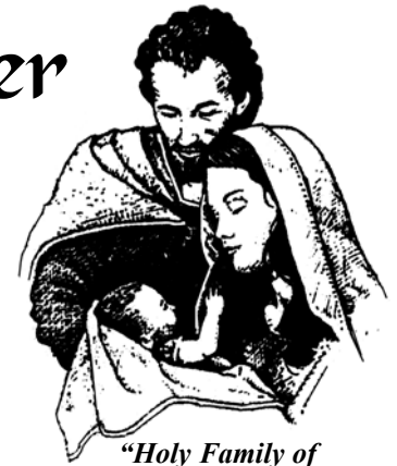
“Holy Family of Nazareth, Pray for Us”