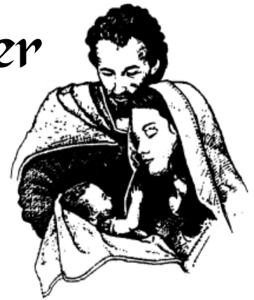
"Holy Family of Nazareth, Pray for Us"