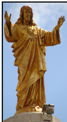
Picture from Fatima, Portugal