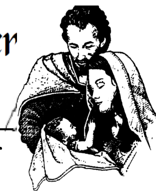
"Family of Nazareth, Pray for Us"

The Albany Diocesan Division of THE WORLD APOSTOLATE OF FATIMA, U.S.A.