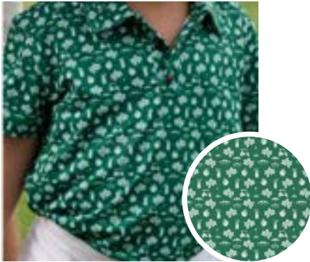
The Masters - Green