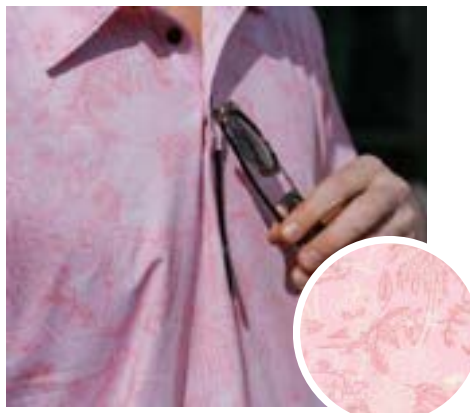
The 19 th Hole - Pink