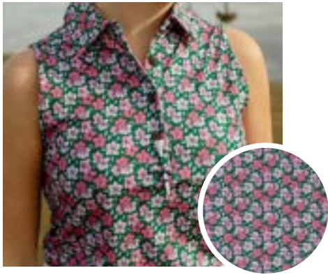
The Azaleas - Green