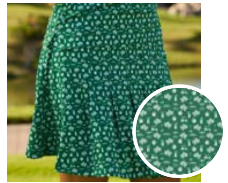
The Masters - Green