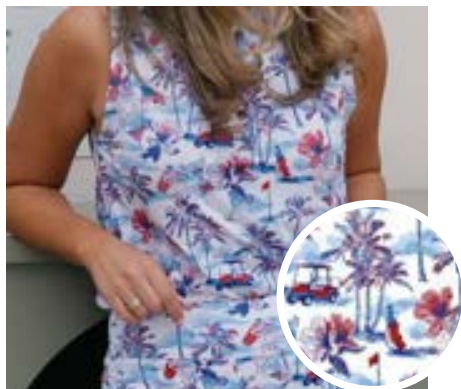
The Red, White, & Bloom