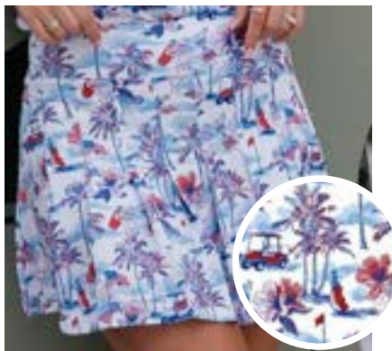
The Red, White, & Bloom