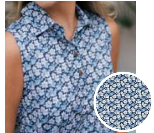
The Azaleas - Navy