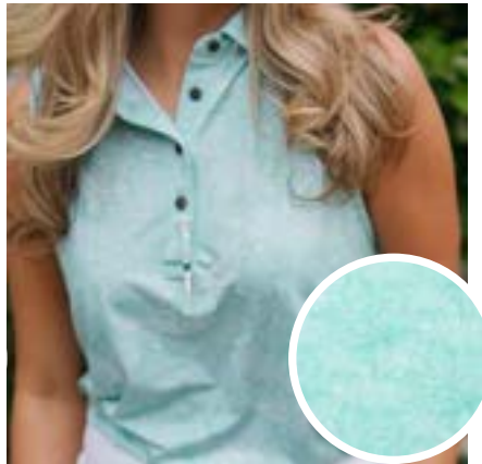
The Mulligan Mint