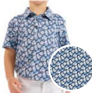
The Azaleas - Navy