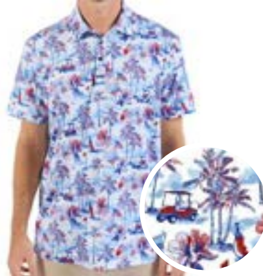
The Red, White, & Bloom