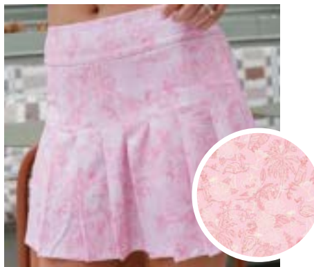
The 19 th Hole - Pink