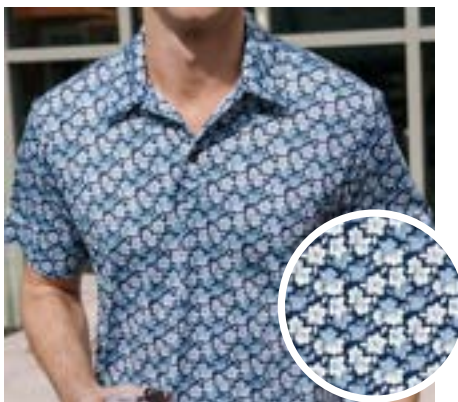
The Azaleas - Navy