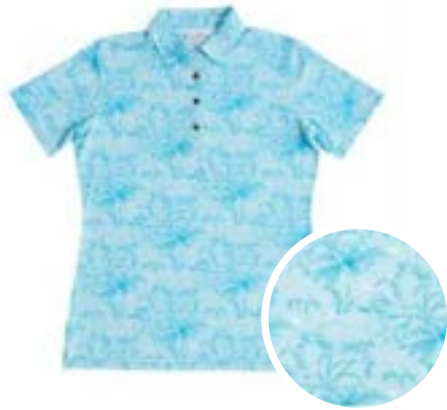
The Ocean Round