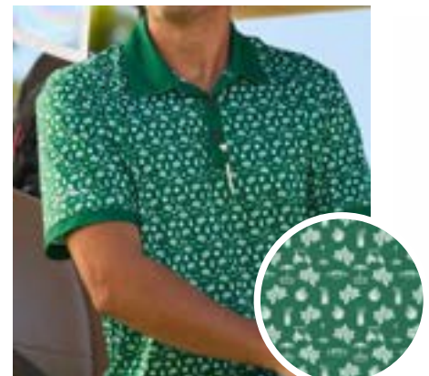
The Masters - Green