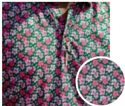
The Azaleas- Green