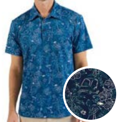
The 19 th Hole - Navy