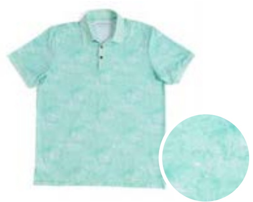
The Mulligan Mint (With Solid Collar)