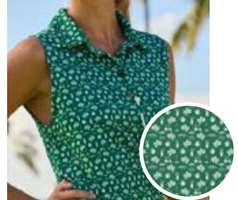
The Masters - Green