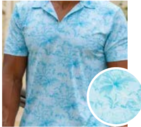
The Ocean Round