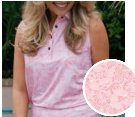
The 19 th Hole - Pink