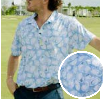
The Oysters - Blue