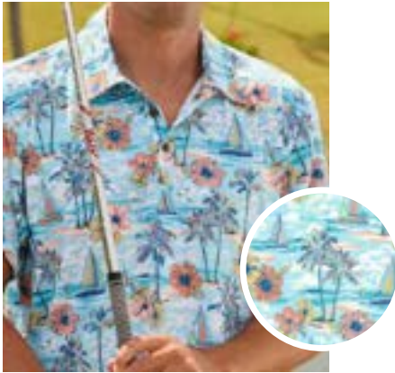
The Ocean Course