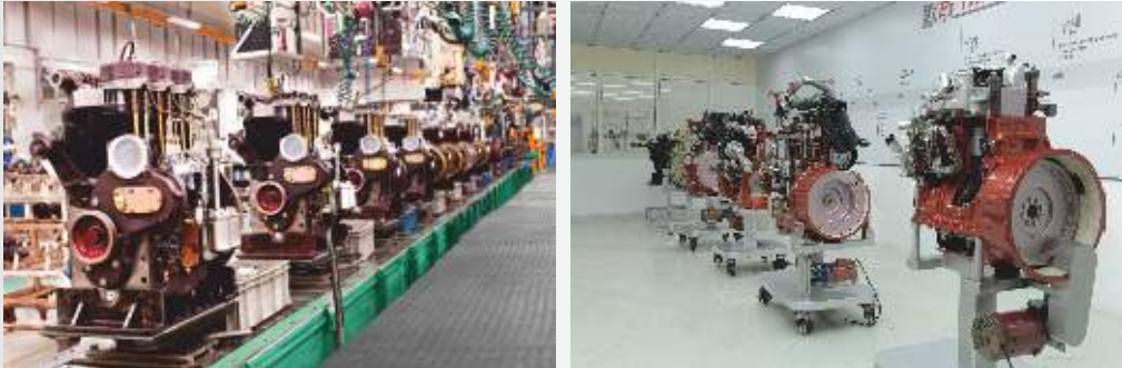
Eicher Engines are Manufactured and Marketed by TAFE Motors and Tractors Limited, under a license from Eicher Goodearth Private Limited. "EICHER" is the exclusive trademark of Eicher Goodearth Private Limited.

TMTL engines division offers wide range of air and water cooled engines with CRS and non CRS technology which is helping TMTL carve a unique identity for itself in its quest to truly become #IndiaKaEngine.