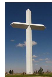
The Cross Groom, TX