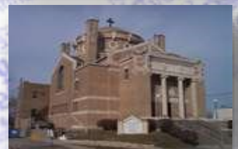
St. John's Greek Orthodox Church

Deposit: $200 pp Optional Trip Cost Protection : $75 pp Both Due At Sign-up