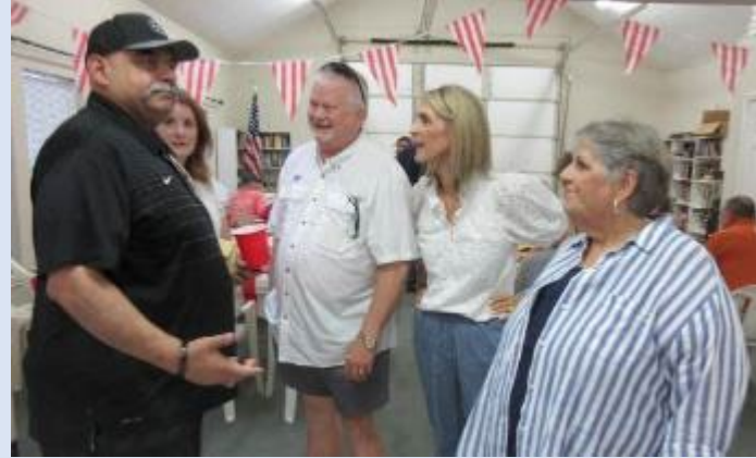
Circus Ad Sales Kick-off Party