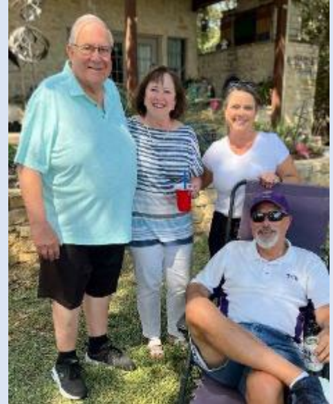
Golf Unit Fish Fry at Bettinger's on August 25