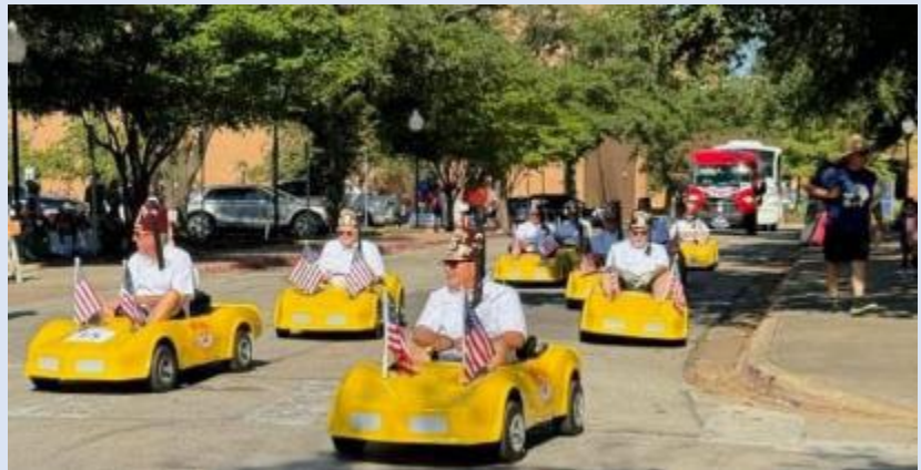
Enjoyed some fellowship at our Summer Party.