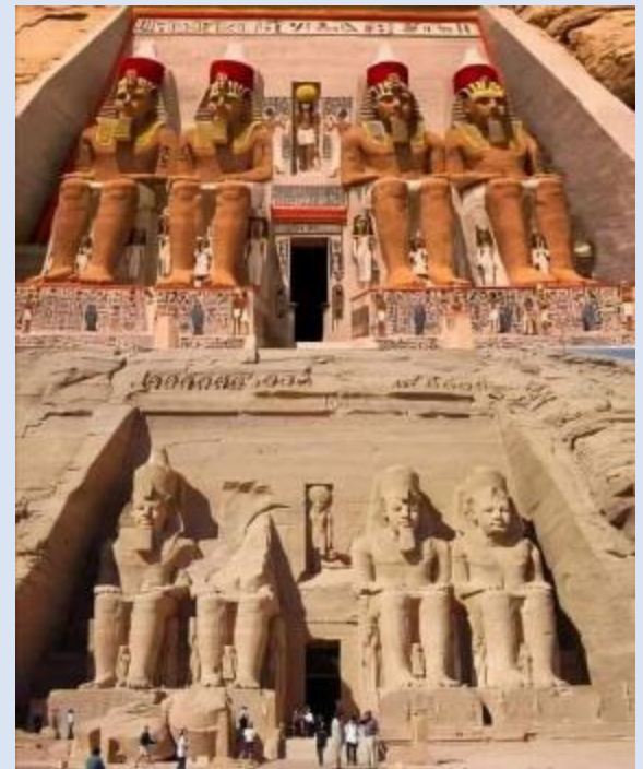
Photo: Are they wearing Fez? No, but from a distance it seems like it. Is it a symbol that we should notice and research? Yes.

We now have 3 members. One member is a Past Potentate (is also PM, current DD at Large, and Past Officer in GL line, is PHP, Order of High Priesthood, etc); another member is PM (also is PHP, PTIM, Order of High Priesthood, Order of Silver Trowel, York Rite DD 4 times), and one member went to Egypt 2 times in 2023. We want to get enough members to form a parade unit.