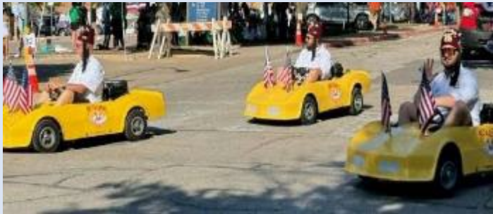
Car-Vettes participated in the Arlington parade.