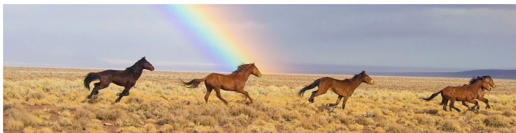
Creative Commons Attribution 2.0 Generic license.