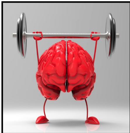
Answer to the October 2021 Puzzle regarding Personal Injury Terms