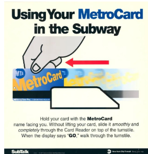
Pictured above: Early advertisement showing instructions on how to use your MetroCard