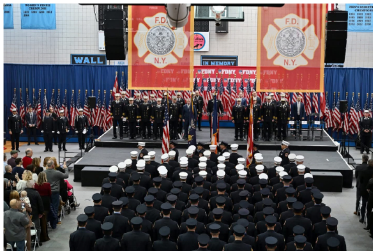
Left photo shows the newly graduated class of EMS. Photo above shows opening prayer at the Dec. 22, 2025 promotional ceremony.