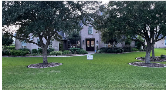
July, 2021 - 1010 Kings Forest