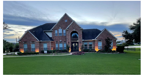
August, 2021 - 1018 Kings Forest

Congratulations to the winners of the July and August Yard of the Month Award each receiving a $50 gift card to Enchanted Forest.