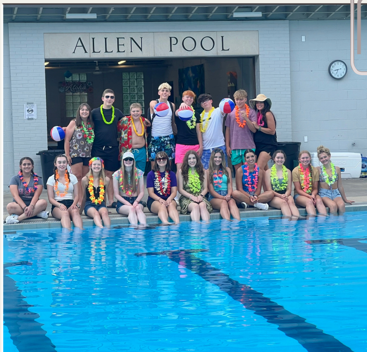
80'S RAD RADIO SHOW