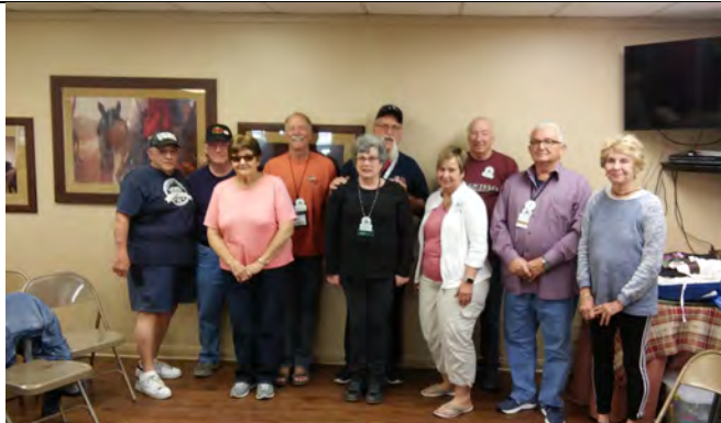
The Saturday "A" team: Scored 6