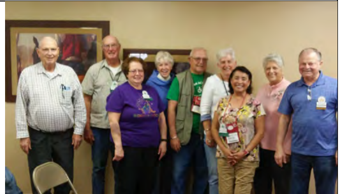
The Saturday "B" team: Scored 11