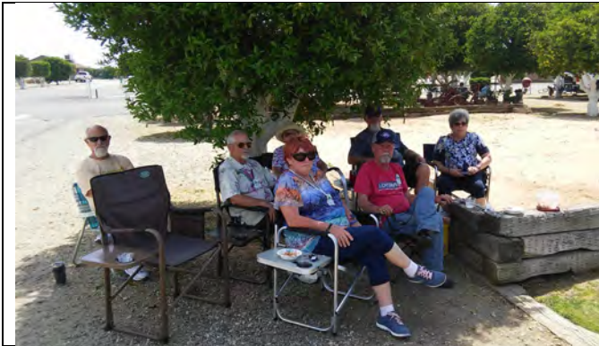
The Baseball Teams Getting Ready