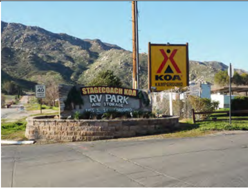
The Welcome Sign