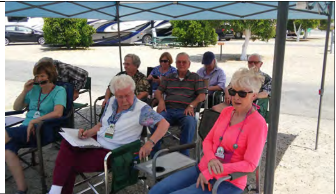
This Team is Waiting for the First Inning to Begin