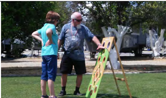
Making Sure the Rules are Understood