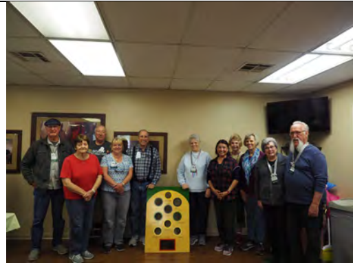
The Winning Team - Friday