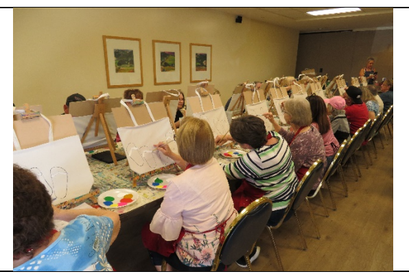
Sip and Paint – More Sipping than Painting?