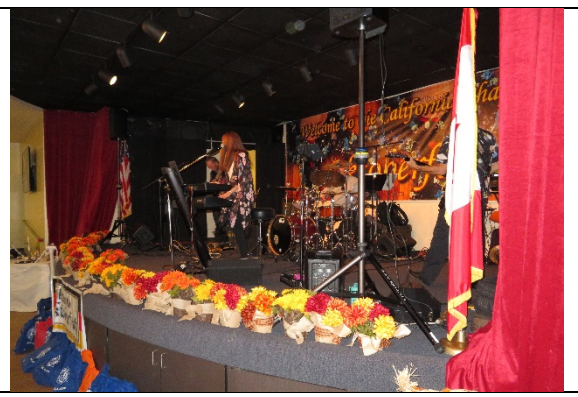
Great Music by the "American Made Band"