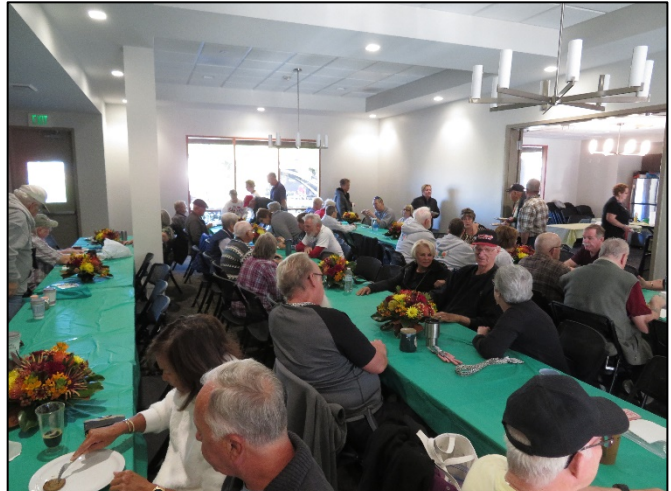
... Fed a Hungry Crowd