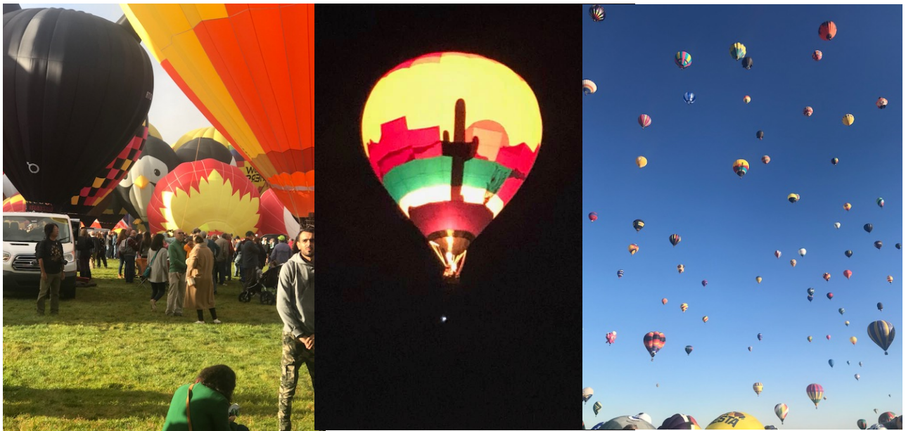
Here are photos of balloons on the ground, lite up at night and filling the sky.