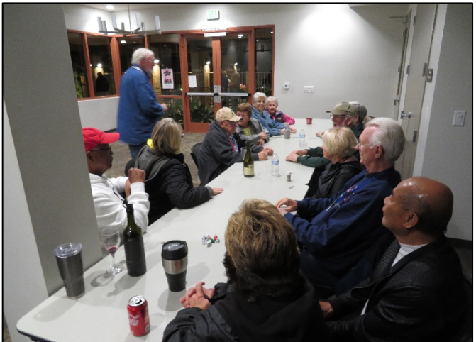
The Evening Game Tables were Full