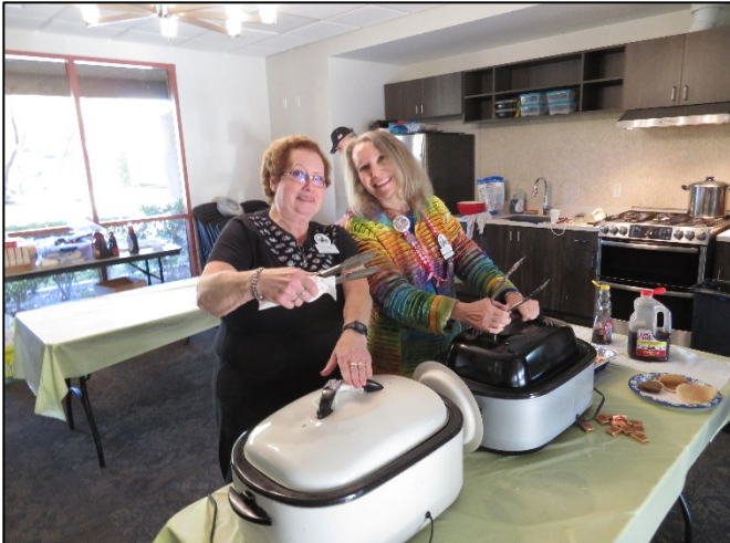
Our Smiling Breakfast Servers...