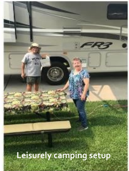
Leisurely camping setup