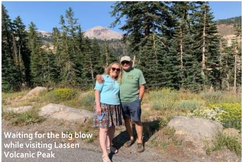
Waiting for the big blow while visiting Lassen Volcanic Peak