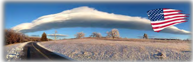
Winter in Shenandoah - Shenandoah National Park