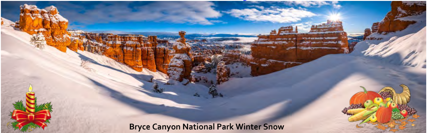
Bryce Canyon National Park Winter Snow