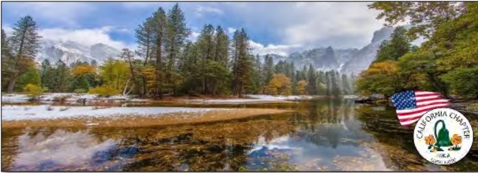
Merced River First Snow—Panorama-Yosemite National Park