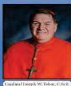
Cardinal Joseph W. Tobin, C.S.C.B.