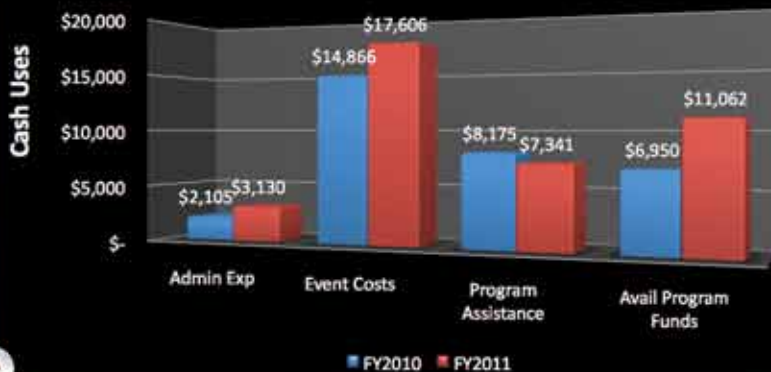
Cash Uses: FY2010 vs FY2011

◀ Combined Program Assistance and Available Funds improved by 22% to $18,400