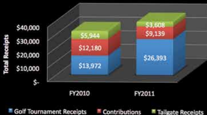
Revenue Sources: FY2010 vs FY2011

Total Receipts increased by 22% driven by success of the 2nd Annual SDFC Golf Tournament ▶