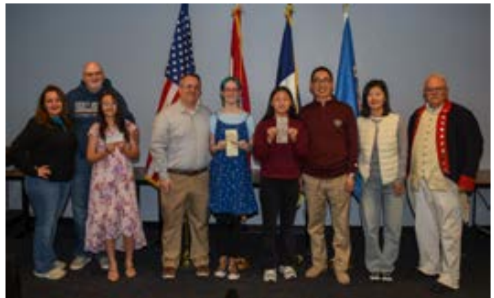
Contestants with their parents.