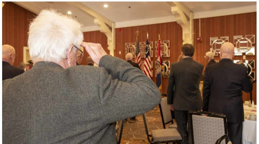
An SAR member saluting during the presentation of Colors.