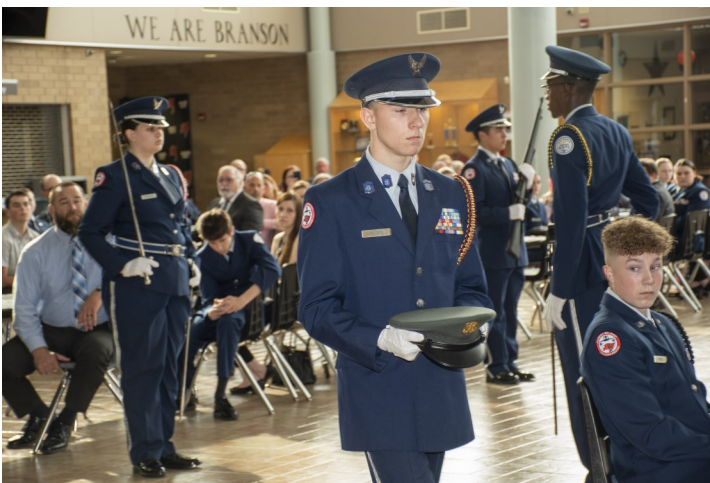
Honor Guard presenting covers to the missing man table.