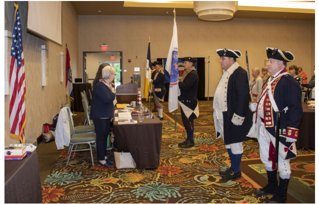
The Color Guard present Colors at the beginning of the Missouri Society SAR Congress.