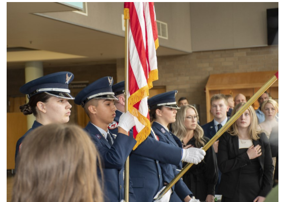
Cadet Color Guard presenting Colors at the beginning of the event.

The following pictures are from the Branson High School AFJROTC dinner and Awards Ceremony on April 23.