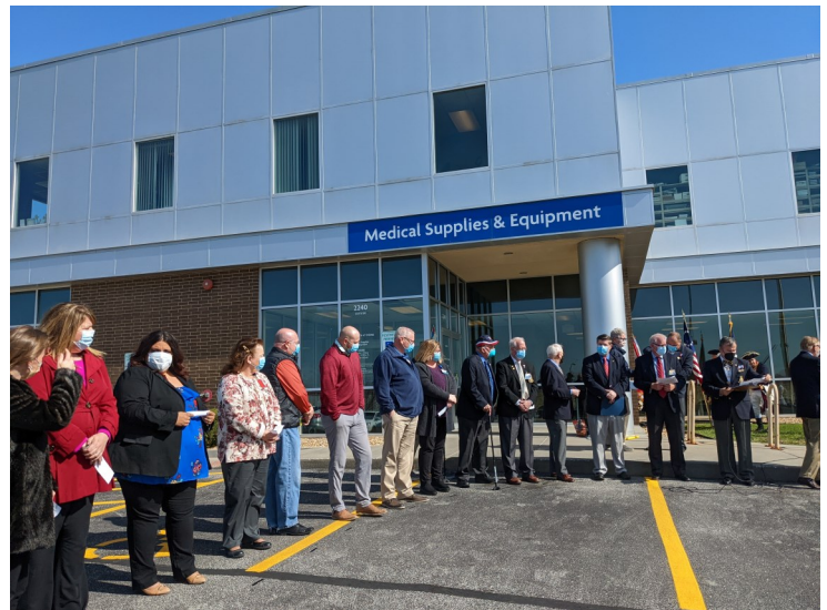
Cox Medical Flag Retirement Ceremony on April 18.

Compatriots and Cox employees stand waiting for their turn to retire their piece of the flag.