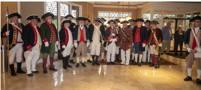
Color Guard members from across Missouri.