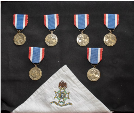
250th Medals given to Cadets at the dinner.

The following pictures are from the Branson High School AFJROTC dinner and Awards Ceremony on April 23.