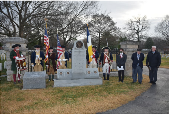
OMC at the Springfield National Cemetery at the Pearl Harbor Remembrance Stone.

Eighty years ago, at this hour, Japanese fighter planes attacked the United States Naval Base at Pearl Harbor, destroying much of our Pacific Fleet and killing more than 2,400 Americans, and injuring countless others. The following day, President Franklin D. Roosevelt called on Congress to declare war and "make it very cer-