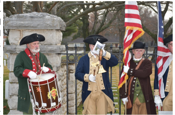
Ringling of the bell at Springfield National Cemetery at the Pearl Harbor Remembrance Stone.

From the docks of Pearl Harbor to the beaches of Normandy and far around the world, brave patriots have served their country and