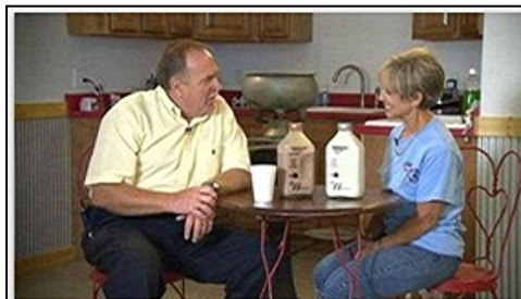
From Grass to Glass: Small Dairy Pr... 28:09

A few of the 234 titles available in the OzarksWatch Video Magazine collection.