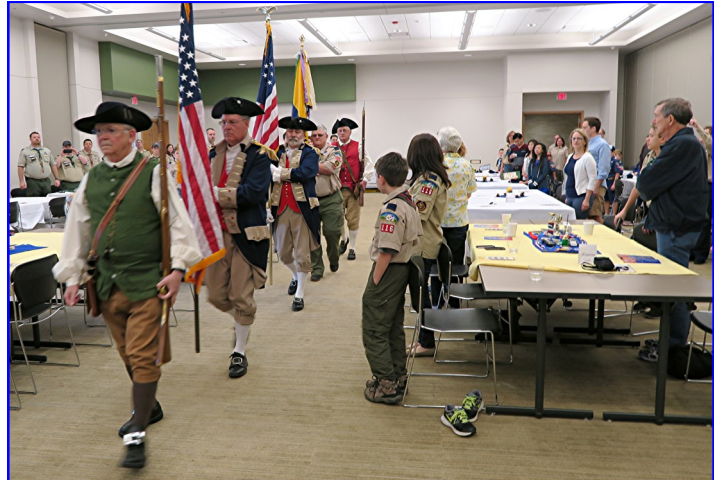
OMC Color Guard opened the ceremonies.

The annual Blue and Gold Banquet was held by Cub Scout Pack 116 on Feb 19, 2016, at the Darr Agricultural Center in Springfield, MO.