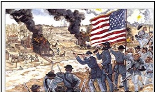
The Civil War Battle of Springfield 27:19

A few of the 234 titles available in the OzarksWatch Video Magazine collection.