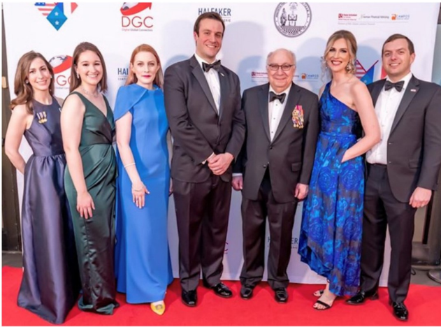
The 2020 Steering Committee of Sweethearts and Patriots at the French Embassy Feb. 8.

Sweethearts and Patriots, the annual fundraiser for wounded warriors, returned for the second year to the French Embassy on February 8 th . A favorite among twenty and thirty some-things, the event has blossomed from a small charity evening at the City Tavern Club to a major social gala, bringing in diplomatic and military leaders.