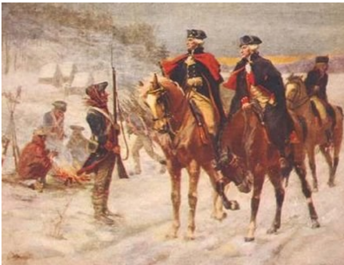
General Washington at Valley Forge.