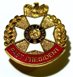
Chapter Past President Pin