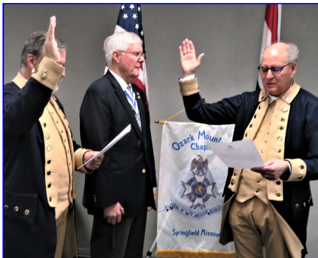
Swearing in Ceremony