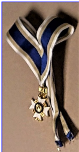
SAR Official Member Badge and the official's neck ribbon.