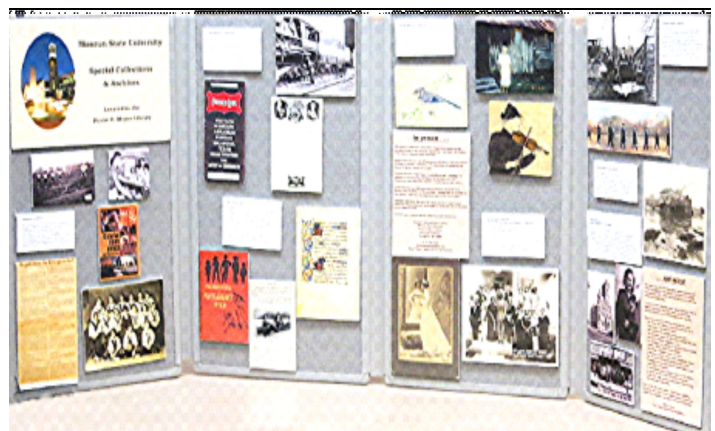
Display board with some of the variety of Special Collections available at the Meyer Library at Missouri State University.