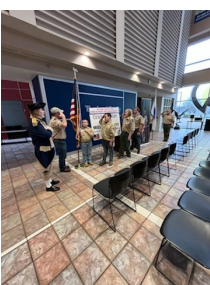
The opening ceremony for the Merit Badge Workshop on March 11th.