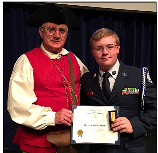
Bolivar High School Air Force JROTC Apr 26, 2016