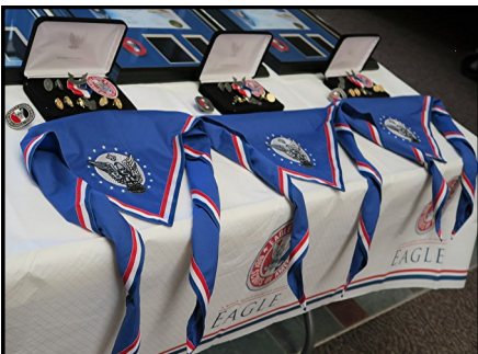
Three Eagle Scout neckerchiefs and pins for three new Eagle Scouts.