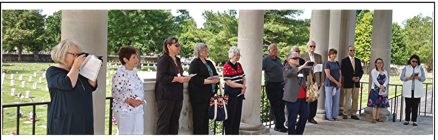
DAR and SAR Attendees