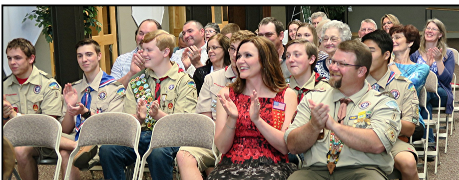
Some of the Eagle Scout Court of Honor attendees. The Court of Honor was held May 1, 2016 at the First and Calvary Presbyterian Church in Springfield, MO.