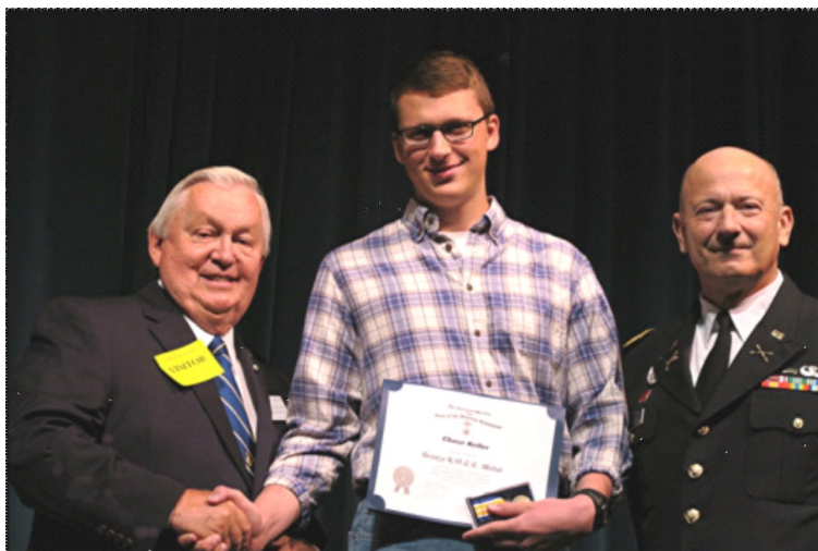
Nixa High School Army JROTC May 10, 2016