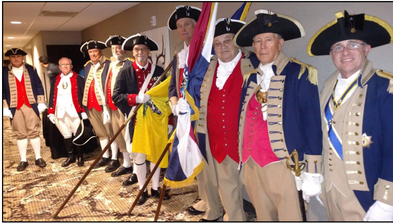
Missouri Society Color Guard