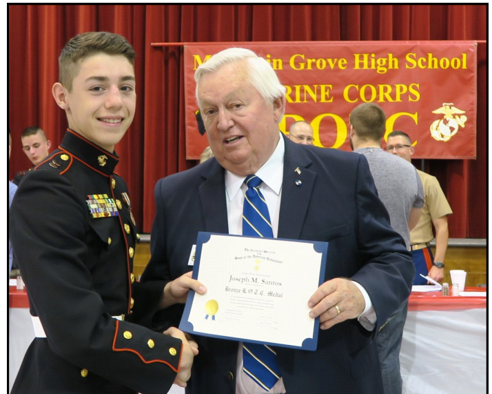
Mtn. Grove High School Marine Corps JROTC May 5, 2016