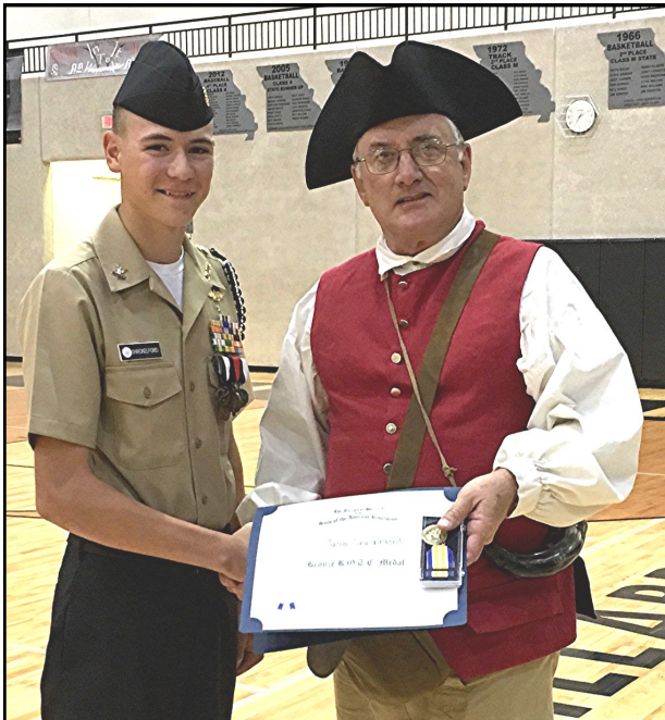
Willard High School Navy JROTC Apr 18, 2016