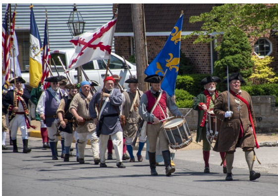
French Militia leads the procession to Ste. Genevieve Catholic Church for the ceremony.

More pictures from Ste. Genevieve color guard event celebrating the Battle of Fort San Carlos.