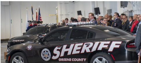
Traditional Cornerstone Dedication Ceremony Greene County Sheriff's Office & Jail