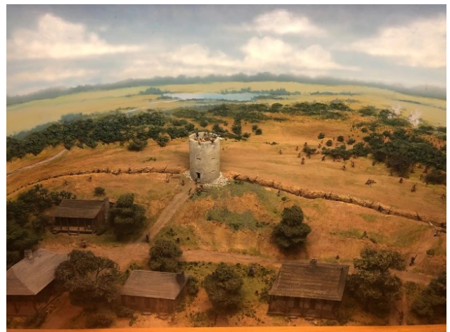
Model of the Battle of Fort San Carlos fought on May 25, 1780, in the Old Court House in St. Louis, part of the national park.