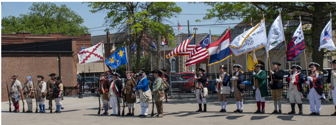
Musketeers and flagbearer's at attention.