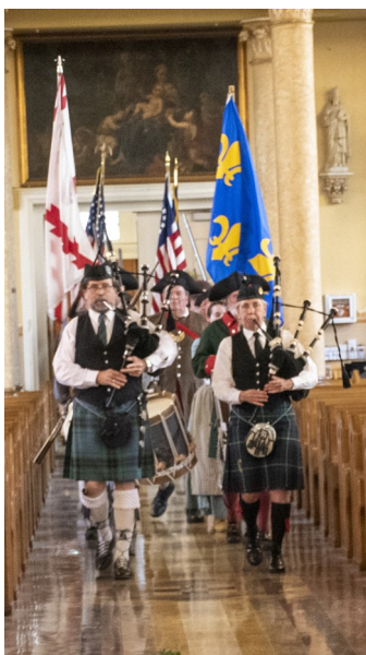
Bag Pipes lead into the church.