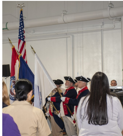
Two more pictures of the Greene County Jail Cornerstone Laying.