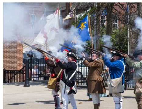
MOSSAR Color Guard fire their muskets.