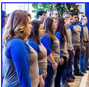
OTC Concert Choir