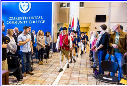
Left: The OMC Color Guard presented the colors at the opening ceremonies.