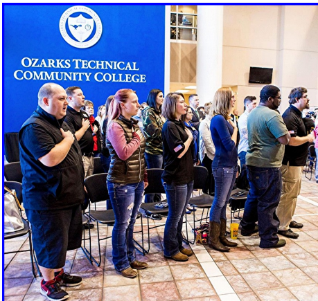
Military veteran students attended the OTC Veterans Day event.