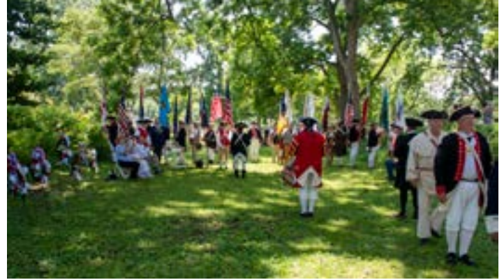
Color Guard posting Colors at the Memorial Cemetery in Ste. Genevieve.