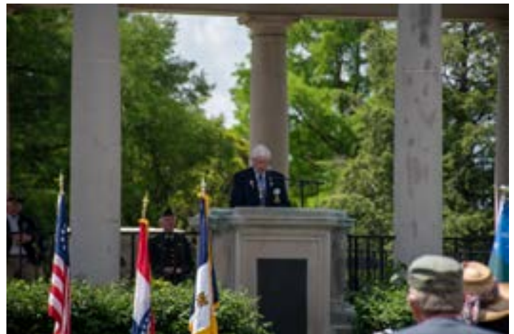
Top: Color Guard marching at the Memorial Day Ceremony held on May 25th at the Springfield National Cemetery.