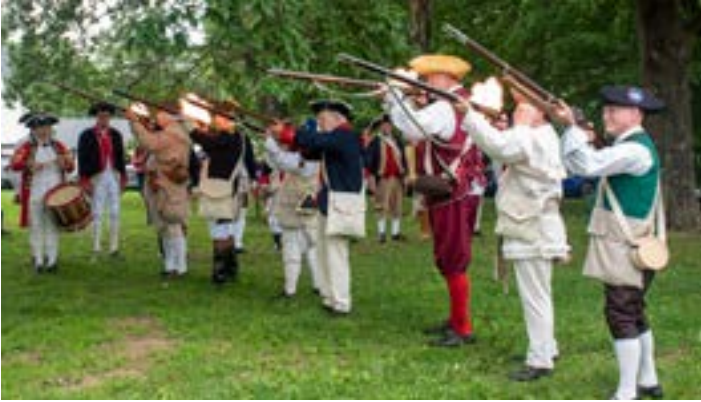
Bottom Right: Color Guard Musketers firing one of three volleys at the Old Salem Church Cemetery.