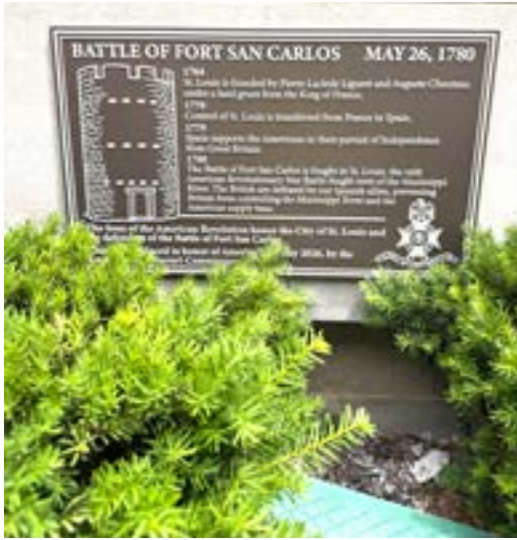
The plaque for the Battle of Fort San Carlos has been replaced.