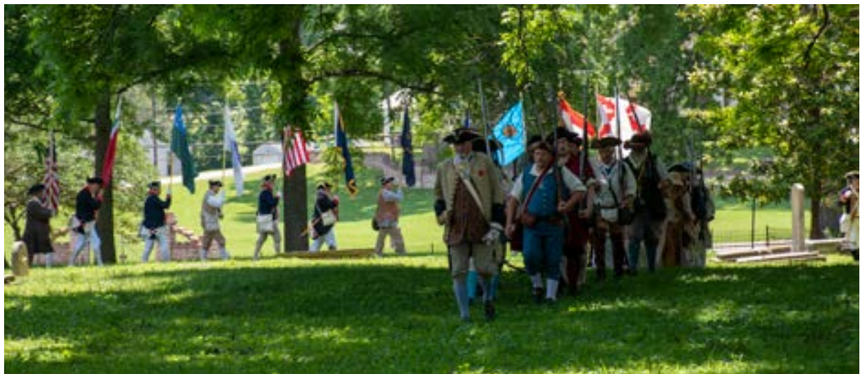
On May 31st, the MOSSAR Color Guard along with the French Malice (Malita), presented Colors for the Ste. Genevieve commemoration of the Battle of Fort San Carlos.