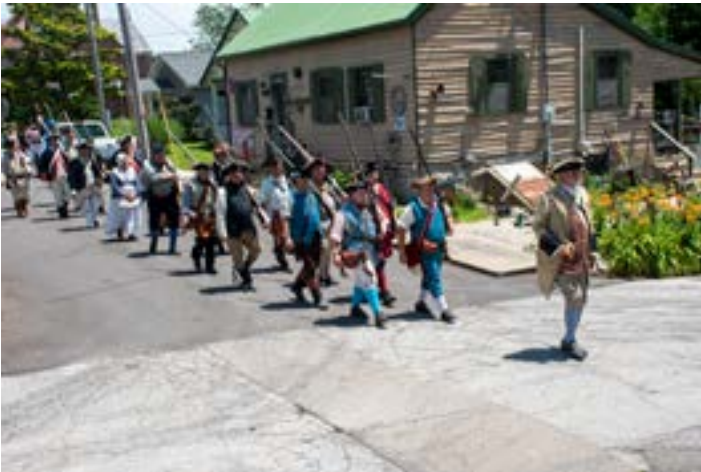
The French Malice marching toward the Memorial Cemetery in Ste. Genevieve.