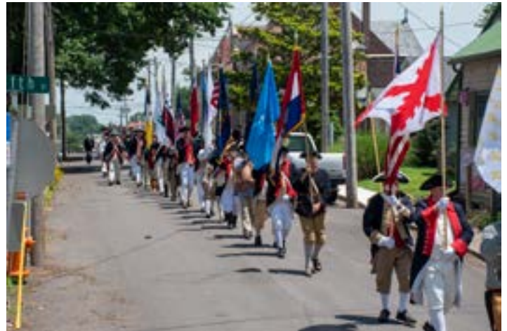
MOSSAR Color Guard marching toward the Memorial Cemetery in Ste. Genevieve.