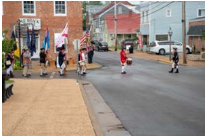
MOSSAR Color Guard marching to the Francois Valle II house for a remembrance activity.