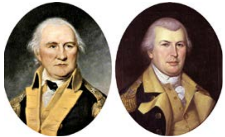
Daniel Morgan, left, and Nathanael Green, right, portraits by Charles Willson Peale.

The position of Sherrills Ford affected deployments by both Morgan and Greene. Morgan, thinking he divined Cornwallis's plan, originally decided to "Leave Open" Sherrills Ford and defend only the downstream river crossings.[33] Morgan, again trying to decide where