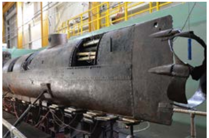
The H. L. Hunley as she is today.

On the evening of February 17, 1864, the H. L. Hunley became the world's first successful combat submarine by sinking the USS Housatonic. After signaling to shore that the mission had been accomplished, the submarine and her crew of eight mysteriously vanished. Lost at sea for over a century, the Hunley was located in 1995 by Clive Cussler's National Underwater and Marine Agency (NUMA). The innovative hand-cranked vessel was raised in 2000 and delivered to the Warren Lasch Conservation Center, where an international team of scientists are at work to conserve the submarine for future generations and piece together clues to solve the mystery of her disappearance. The Hunley Project is conducted through a partnership with the Clemson University Restoration Institute, South Carolina Hunley Commission, Naval History and Heritage Command, Charleston Naval Complex Redevelopment/Naval Base Museum Authority, and Friends of the Hunley.