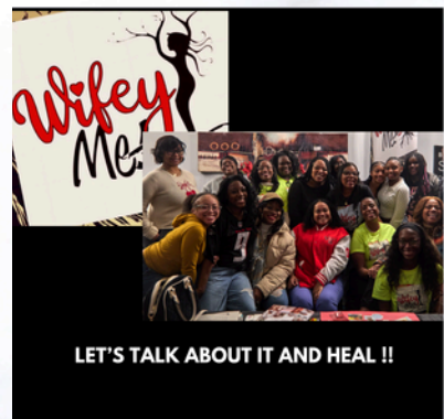
LET'S TALK ABOUT IT AND HEAL !!