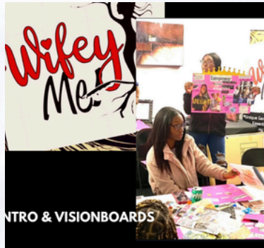
INTRO & VISIONBOARDS