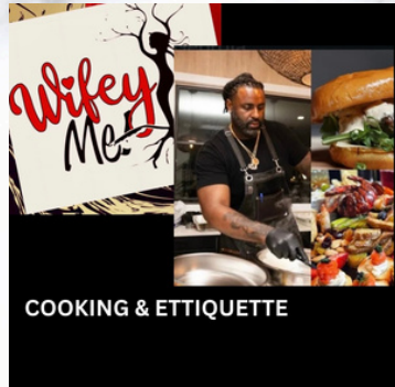
COOKING & ETTIQUETTE