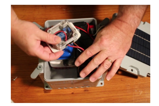
Removing Time Delay Enclosure Figure 4

SPECIFICATIONS: Pump rate: 750 GPH Discharge Outlet: 3/4" Battery: 12 volt Gel Cell 7 amp. Hour Weight: 10 Lbs. Solar charge: 2 Watt (130 milli amp max.) Solar controller: Float Voltage 13.8 volts Power usage: No power used when pump is not running. Fuse : 5 amp.