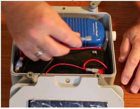
Connecting Power Figure 2