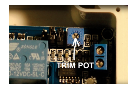
Time Delay Adjustment Figure 5