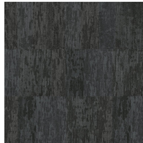
Elevate in "Filter"