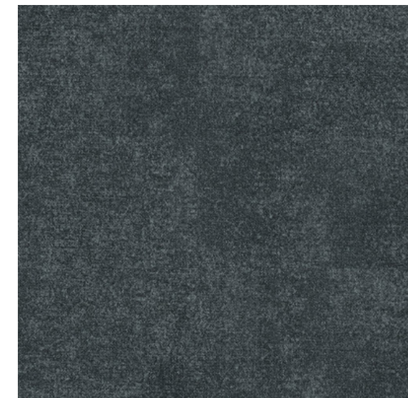
Poured in "Aggregate"