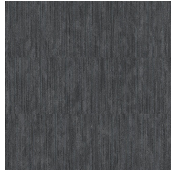
Hub in "Action"