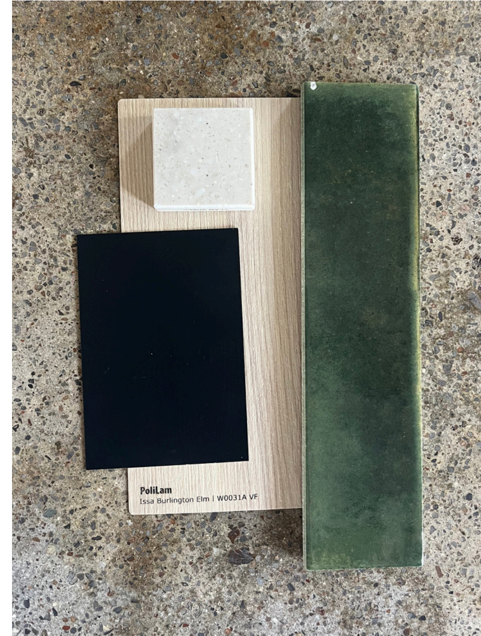
Kitchenette finish samples: countertop, millwork, and tile