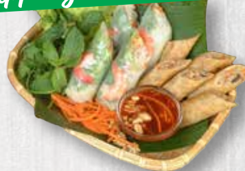
D1. Duo Appetizer