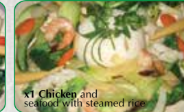
x1 Chicken and seafood with steamed rice