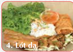
4. Lót dạ