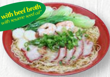
S21 Mì Ba Cô

Served with beef broth "infused" with sesame seed oil