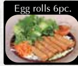
Egg rolls 6pc.