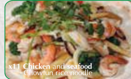
x11 Chicken and seafood Chowfun rice noodle