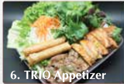
6. TRIO Appetizer