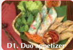
D1. Duo appetizer