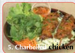
5. Charboiled chicken