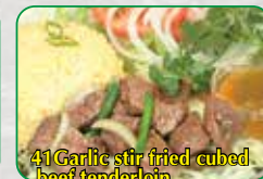
41 Garlic stir fried cubed beef tenderloin