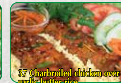
37 Charbroiled chicken over garlic butter rice