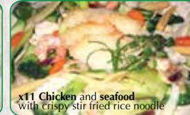
x11 Chicken and seafood with crispy stir fried rice noodle