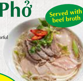
Served with beef broth

Phở Ba Cô is famous for its authentic Vietnamese beef rice noodle soup, a flavorful beef broth slowly cooked for hours perfected with a blend of herbs and spices. Ours is a unique, tasty and healthful soup that everyone loves and craves for. Choose the following meat toppings served over flat thin rice noodle, in this flavorful soup, topped with white and green onions.