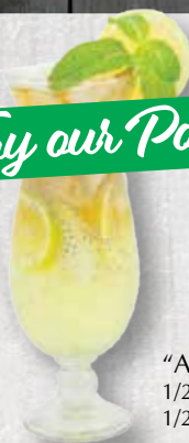
"Arnold Palmer" 1/2 Lemonade 1/2 Jasmine Tea with Basil seeds