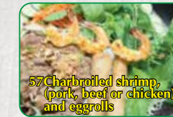
57 Charbroiled shrimp, (pork, beef or chicken) and eggrolls