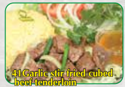
41 Garlic stir fried cubed beef tenderloin