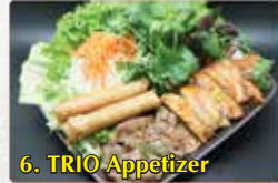
6. TRIO Appetizer