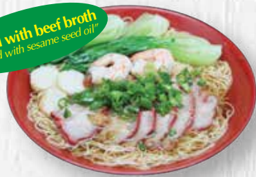
S21 Mì Ba Cô