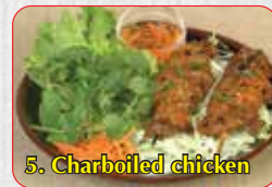
5. Charboiled chicken