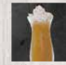
12. Vietnamese ice coffee