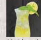
3. Fresh Lemonade