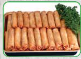
Crispy eggrolls $39 (25)***