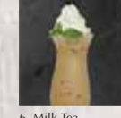
6. Milk Tea