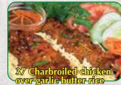
37 Charbroiled chicken over garlic butter rice