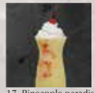
17. Pineapple paradise