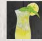
2. Fresh lime soda

Please tell your friends, families, & co-workers about us. Share this menu with your friends!