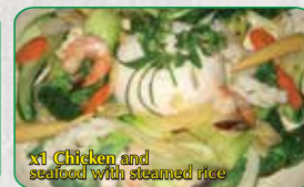
x1 Chicken and seafood with steamed rice