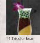
14. Tricolor bean

Add Ons 65¢ each Boba | Basil Seeds Red Bean | Grass Jelly