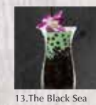
13. The Black Sea