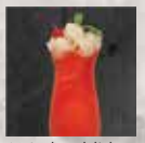
16. Lychee delight