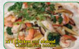
x11 Chicken and seafood Chowfun rice noodle