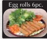
Egg rolls 6pc.