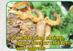
57 Charbroiled shrimp, (pork, beef or chicken) and eggrolls