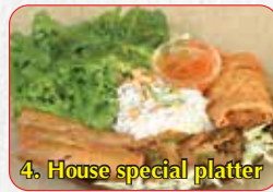
4. House special platter