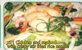
x11 Chicken and seafood with crispy stir fried rice noodle