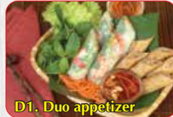
D1. Duo appetizer