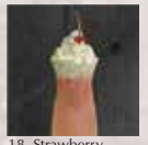
18. Strawberry Smoothie