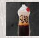
7. Thai ice tea