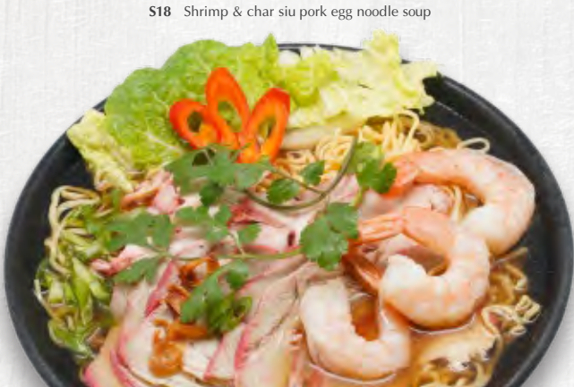
S18 Shrimp & char siu pork egg noodle soup

For guests 12 years old and under. Rice dishes come with a choice of white rice or garlic butter rice.