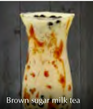
Brown sugar milk tea