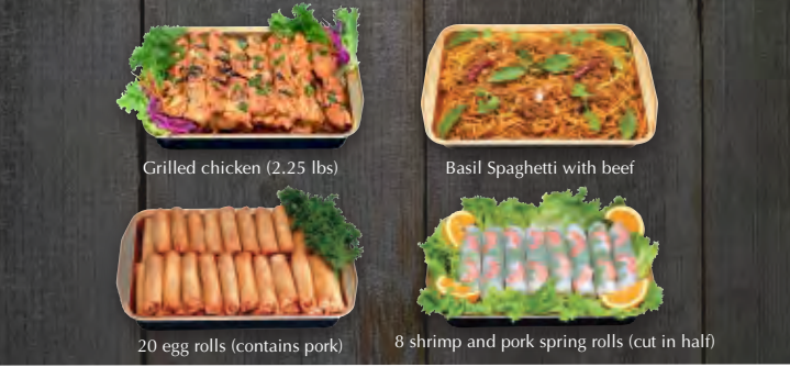
Grilled chicken (2.25 lbs)

Family Feast $159. 00 Looking to cater your next event? Our family feast includes four trays and feeds 8–10 people. (Grilled Chicken,Basil Spaghetti, 20 egg rolls, 8 shrimp and pork spring rolls)