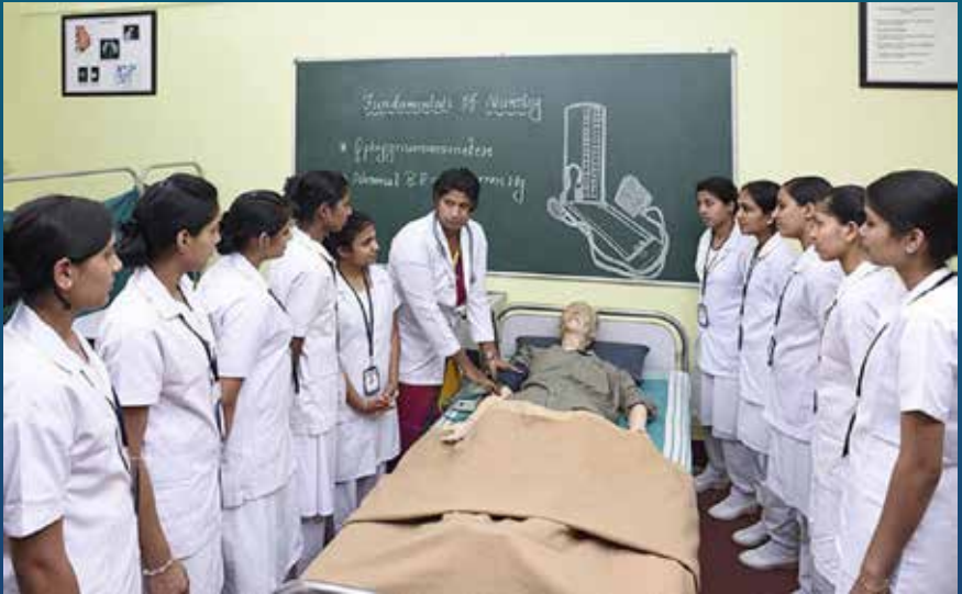
Fundamentals of Nursing Lab