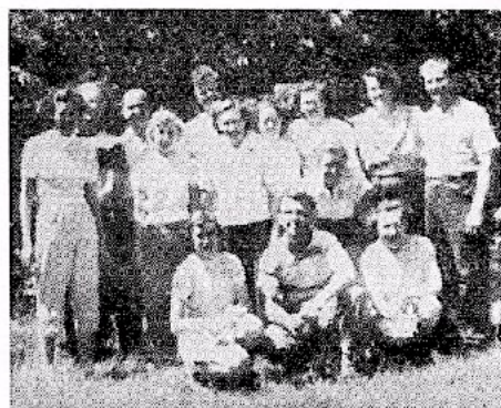
Young Adult Weekend Campers at the Ontario Conference Grounds, July 31 - August 3, 1953.

A BOUT twenty young adults and older young people attended a work camp at the new Ontario Conference Grounds from Friday, July 31 to Monday, August 3.