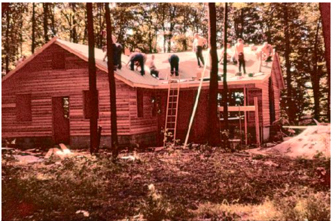
July 1956 • Building the Administration Building