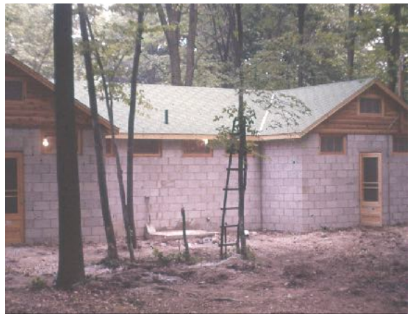
July 1958 • Building the Wash House