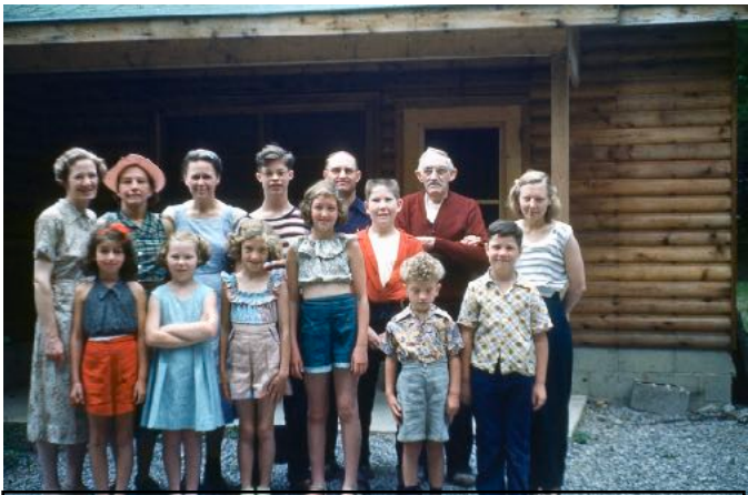
July 1954 • First Family Camp