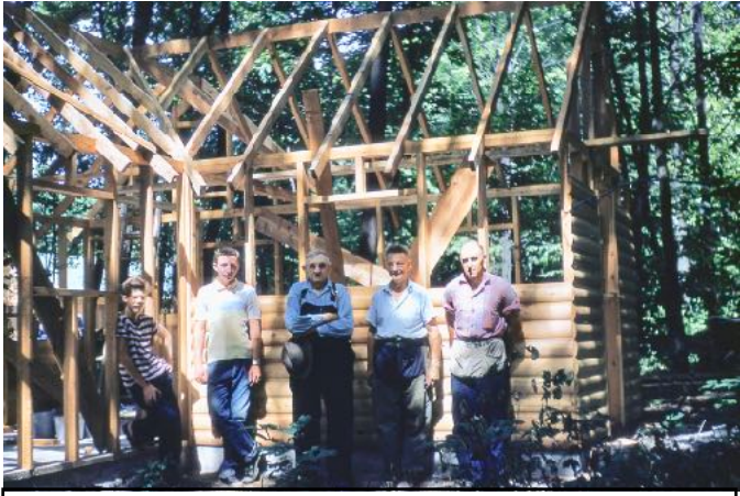
July 1954 • Building Cabin 2