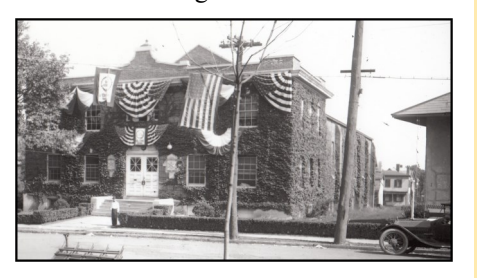
Image: Somerville Armory, corner of Grove & Main, ca 1922. It was demolished in late 1990's. Current site of County Admin. Building.

In addition to the boxing and vaude-ville show ... there will be lots of smokes, a good cigar, and a pipe and tobacco.