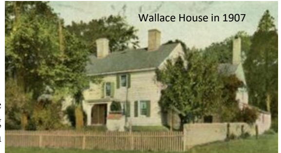
Wallace House in 1907

The stormy skies greatly interfered with the opening exercises at the Wallace House on Thursday afternoon, but the rain stopped long enough for the program to be carried out on the lawn, as had been planned. ... A number of the D.A.R. from other places were here, besides many visitors from this vicinity. The collation provided by the ladies realized a nice sum, which will be used to fit up the house.