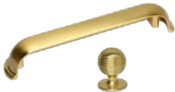
Suite 986 Brass