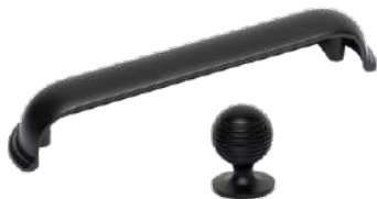
Suite 990 Matt Black