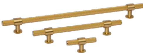
Suite 970+ Solid Brass