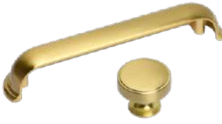
Suite 959 Brass