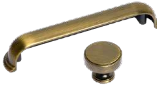
Suite 960 Antique Brass