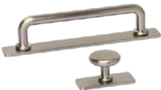
Suite 952 Satin Nickel