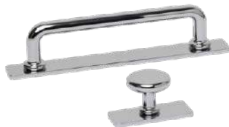
Suite 884 Polished Nickel