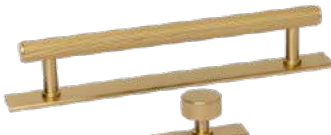
Suite 937+ Solid Brass