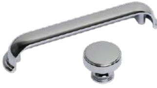
Suite 961 Polished Nickel