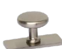
Suite 980 Satin Nickel