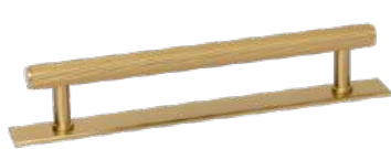
Suite 934+ Solid Brass