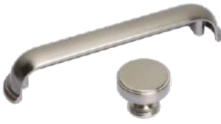
Suite 962 Satin Nickel