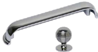
Suite 988 Polished Nickel