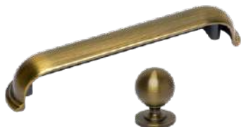
Suite 982 Antique Brass