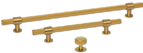
Suite 971+ Solid Brass