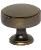
Suite 965 Antique Brass