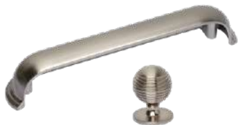
Suite 989 Satin Nickel