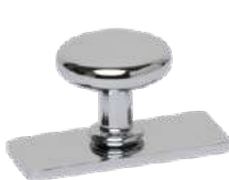
Suite 887 Polished Nickel