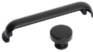
Suite 963 Matt Black