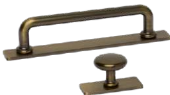
Suite 880 Antique Brass