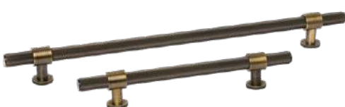
Suite 972+ Solid Antique Brass