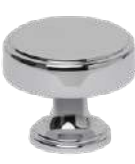
Suite 966 Polished Nickel