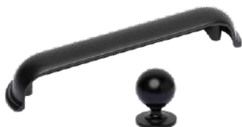
Suite 985 Matt Black