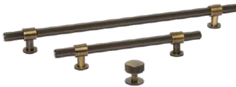
Suite 974+ Solid Antique Brass