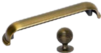
Suite 987 Antique Brass