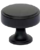
Suite 968 Matt Black