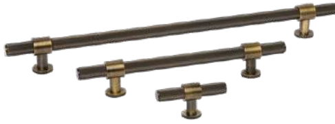
Suite 973+ Solid Antique Brass