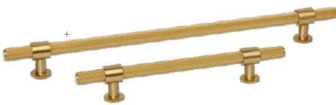
Suite 969+ Solid Brass