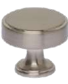
Suite 967 Satin Nickel