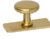
Suite 979 Brass