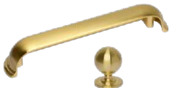
Suite 981 Brass