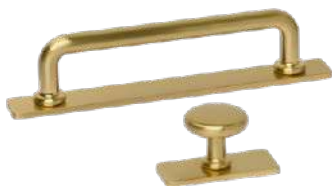
Suite 951 Brass