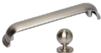
Suite 984 Satin Nickel