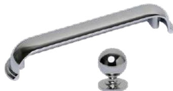
Suite 983 Polished Nickel