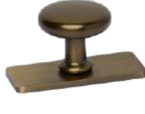
Suite 883 Antique Brass