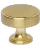
Suite 964 Brass