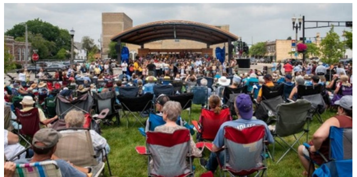
Crowds gathered to dedicate the new Schmitt Brothers Stage in Two Rivers Central Park in July 2023.