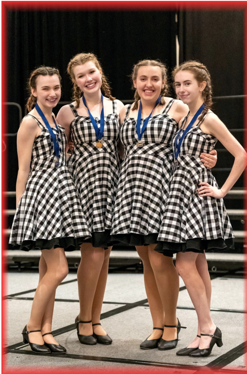
YTBN, from Burlington HS, WI BHS 2023 NextGen Jr. Quartet GOLD medalists!