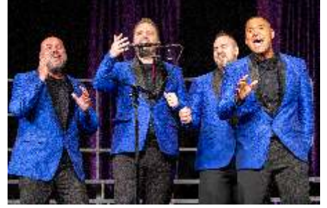
Coulee Classic* (int'l qualifier)