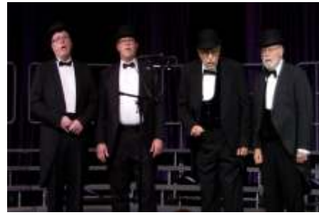
Gay Nineties Quartet