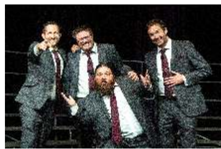
Just One More