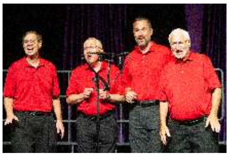
Keys & Chords