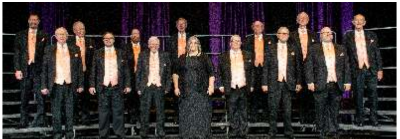
Northern Gateway Chorus