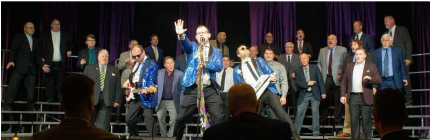
Midwest Vocal Express** (Champions)