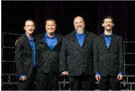
Chill Factor** (Champions)