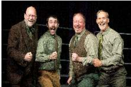
Pour Four More