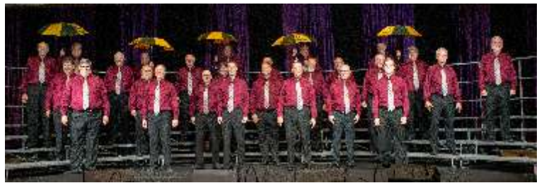
Clipper City Chordsmen