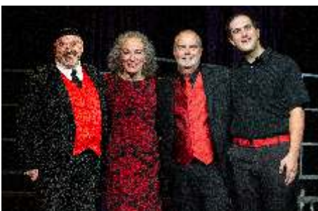
Thrift Store Four