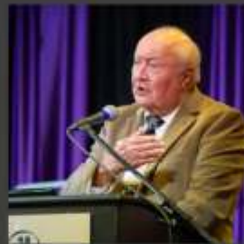
LOL Lifetime Achievement

First Ave and Coulee Classic our LO'L international qualifiers!