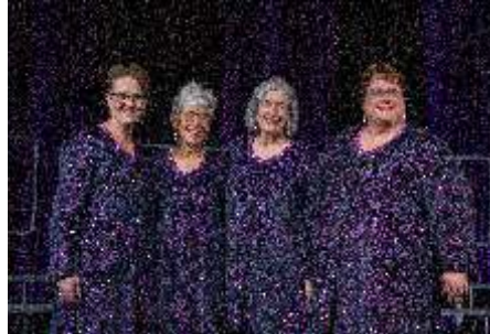
By Request Quartet