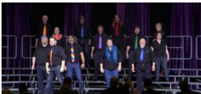
Great Northern Union