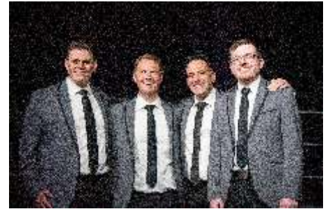
First Ave* (int'l qualifier)