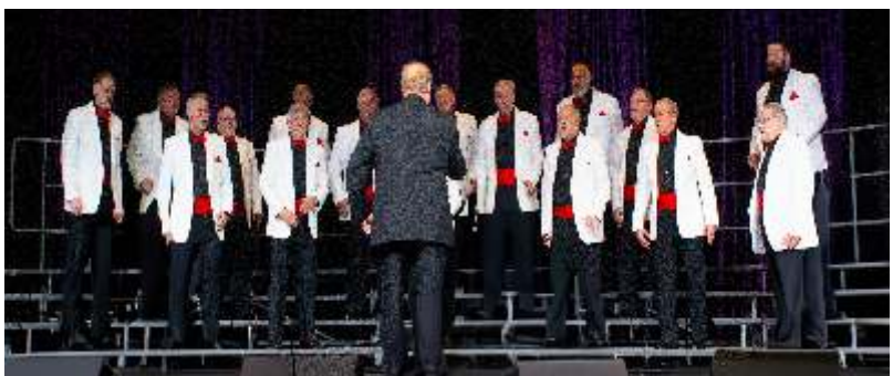
West Central Connection