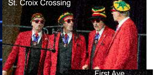
St. Croix Crossing