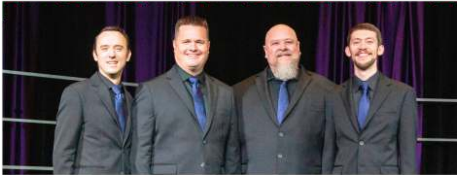
LO'L District Quartet Champions - Chill Factor!