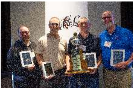
House of Chords