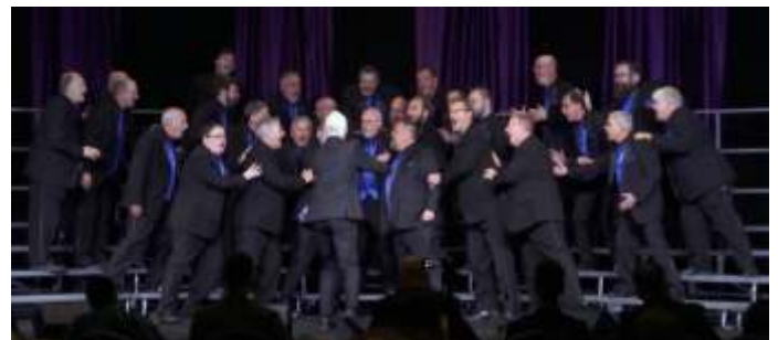
Great Plains Harmony