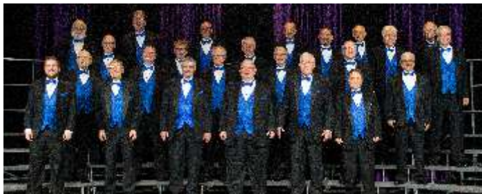
North Star Chorus