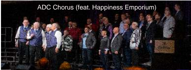
ADC Chorus (feat. Happiness Emporium)